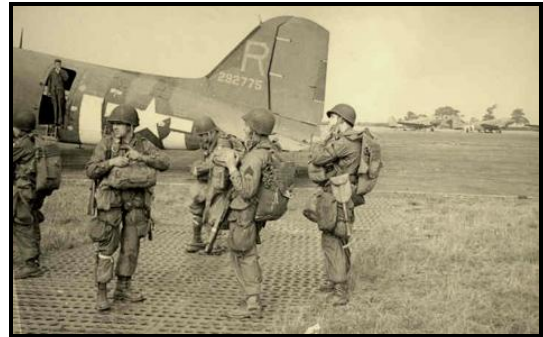
Pre-Invasion, June 1944

Saturday, 17 March, 2012, Day at the Races, 12:00HRS, Tampa Bay Downs Club House